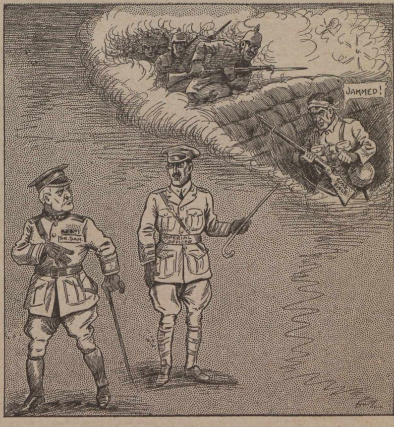
Imperial Officer:—And you Sir Sam and your Government insisted upon your soldiers using this rifle.

The result is evidenced in the brief statement just received from England to the effect that the weapon has been discarded in favor of the Lee-Enfield. The Ross has been the chief weapon of offence and defence of the Canadians during-