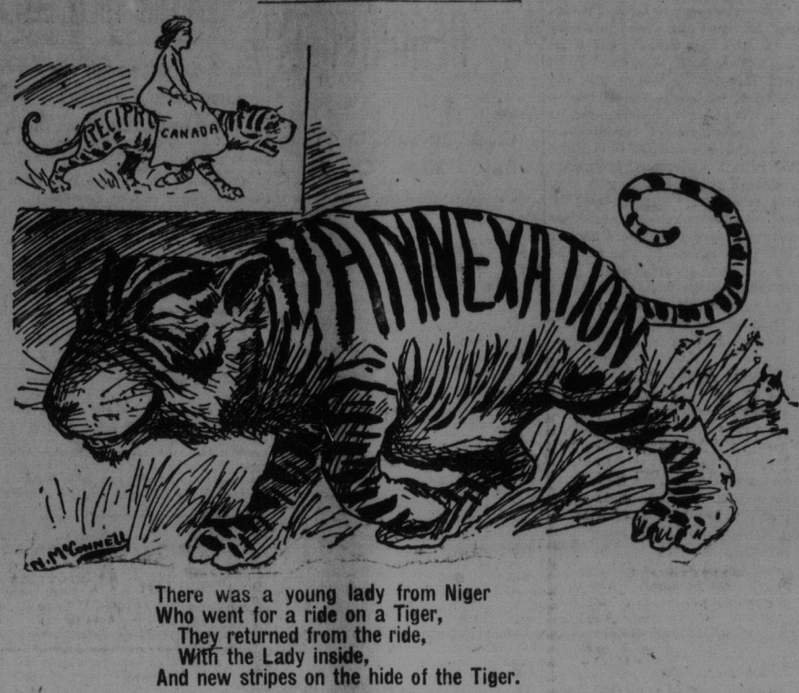
There was a young lady from Niger Who went for a ride on a Tiger, They returned from the ride, With the Lady inside, And new stripes on the hide of the Tiger.