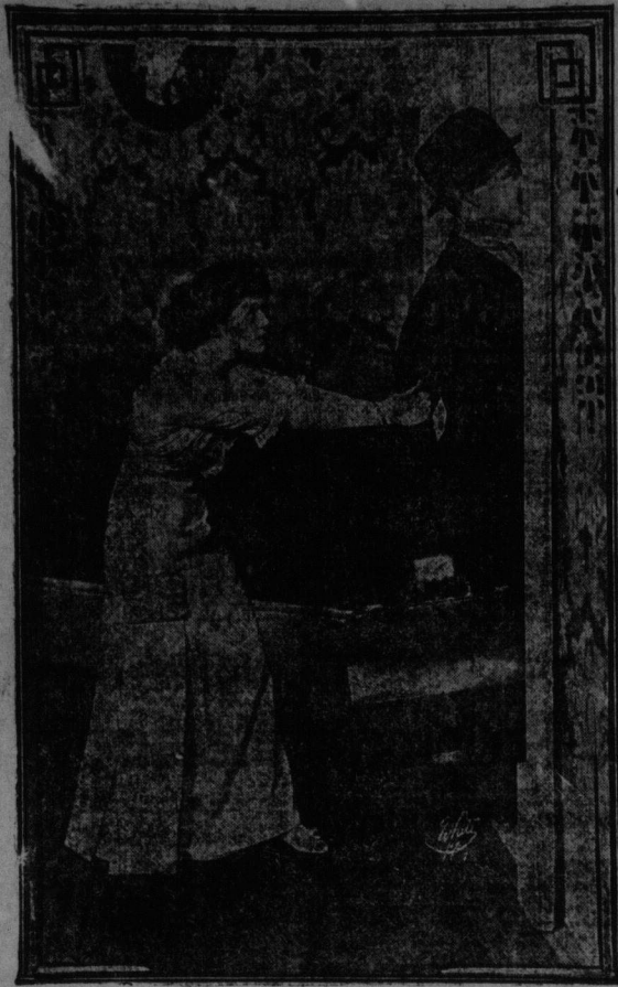
One of the scenes in "Baby Mine," the funny comedy which comes to the Opera House on Monday next.