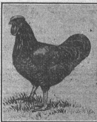
ROSE COMB RED COCKEREL.

THE ROSE COMB REDS. When those Rhode Islanders were casting about for material to make a great utility fowl they must have been stuck on red and hid the idea that red roosters have the maximum of vigor and production, for in manufacturing the Rhode Island Reds they mixed Red Malays, Red Cochins, R. C. Brown Leghorns and threw in a few other breeds for variety. They didn't