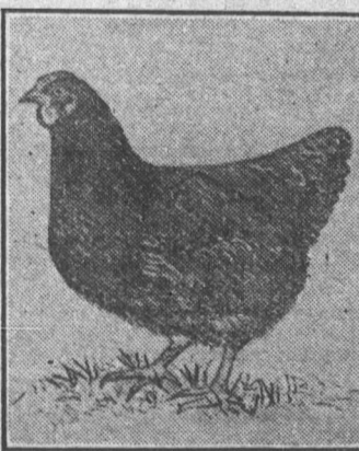
ROSE COMB RED HEN.

The hens are fine layers of nice brown eggs and do not knock off for zero weather, their thick feathering