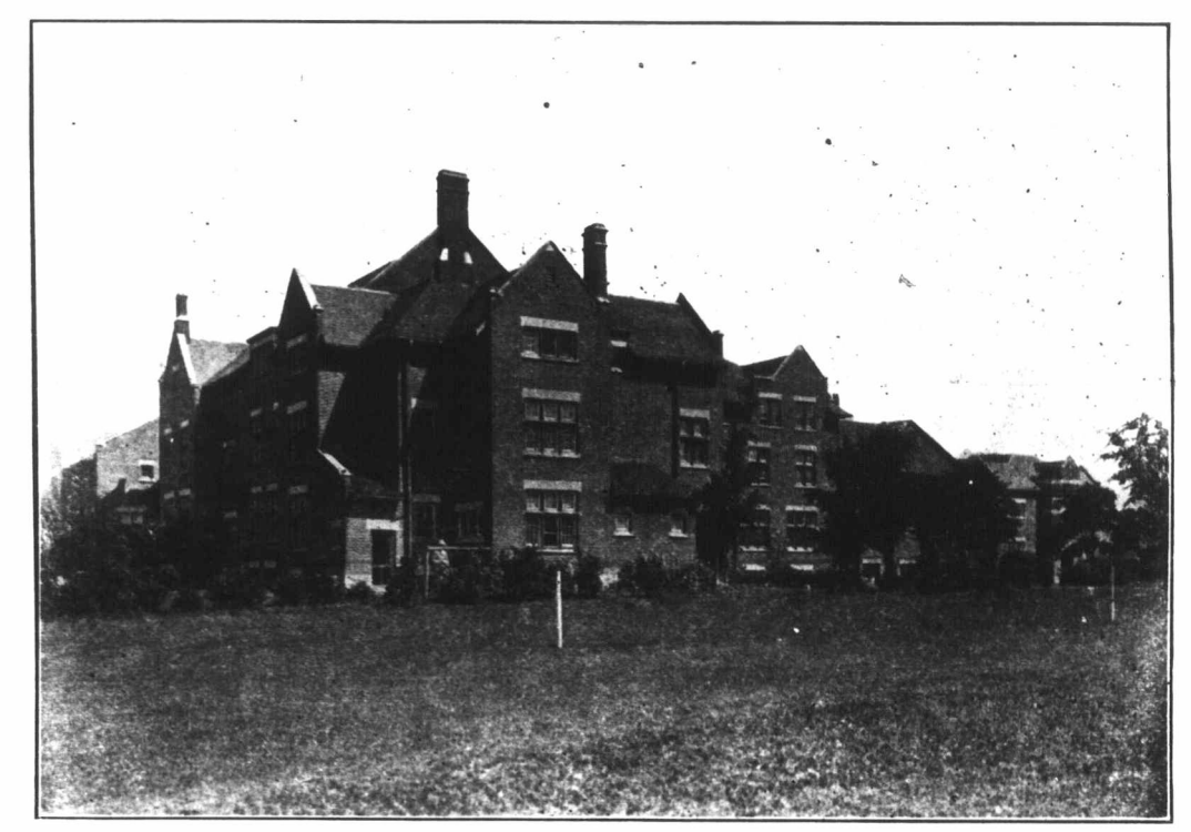
RIDLEY COLLEGE, ST. CATHARINES

At the end of the first verse of the opening hymn the blacksmith leans over and says, "Say, parson, that's a bit low, isn't it?"