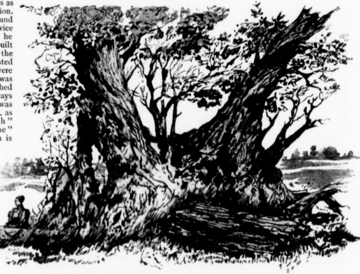
THE OLDEST TREE IN ENGLAND, WYMONDLEYBURY CHESTNUT.

ward and used as a doorstep; he thought it probable that it came from the Abbey, and