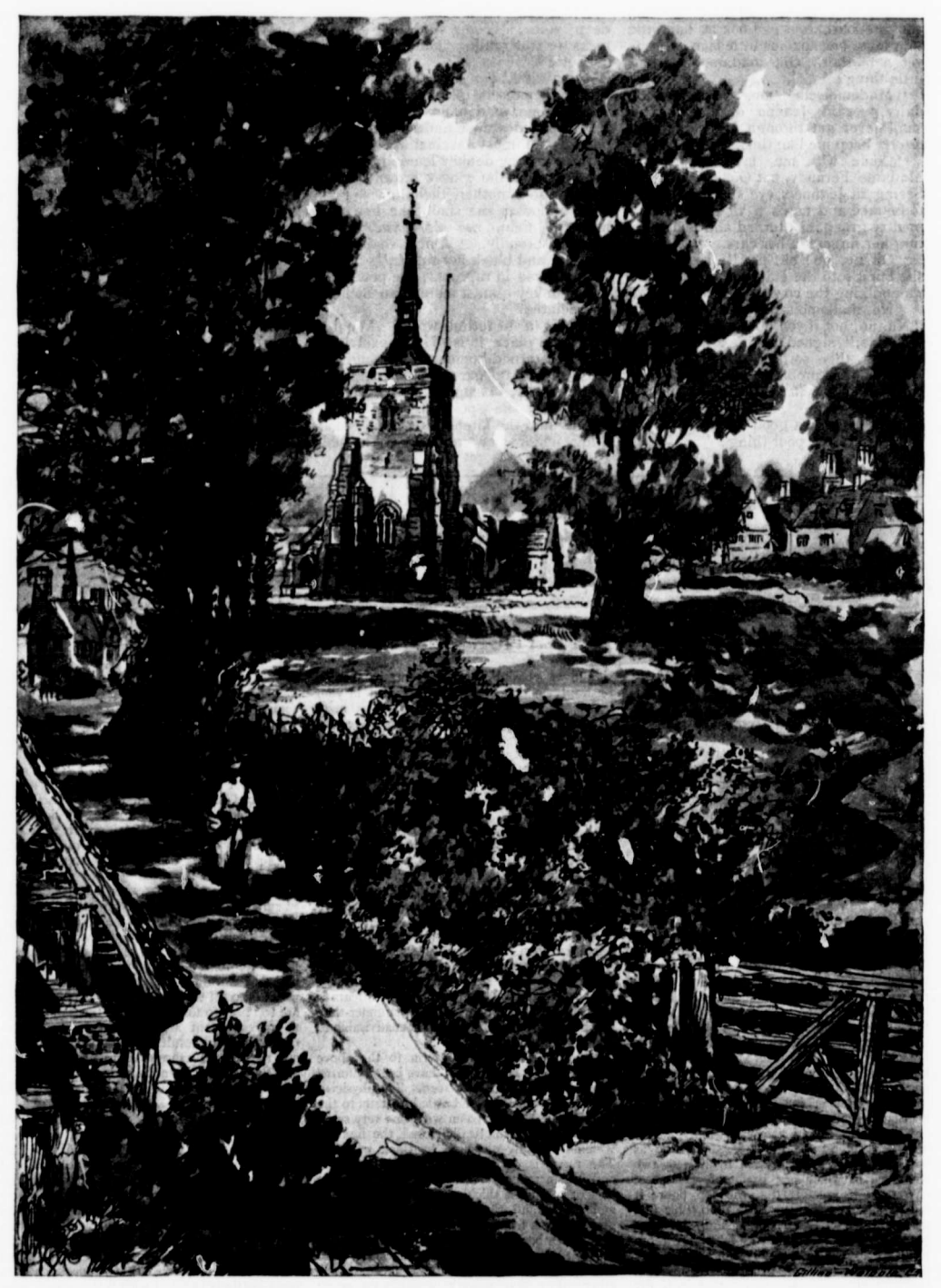
THE VILLAGE OF ST. IPPOLYTE.