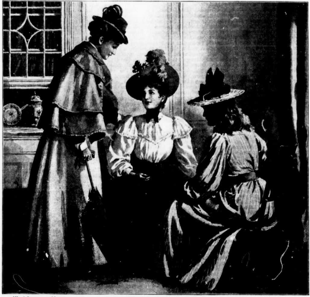
All rights reserved.]

By IDA LEMON, Author of "The Charming Cora," "A Winter Garment," etc.