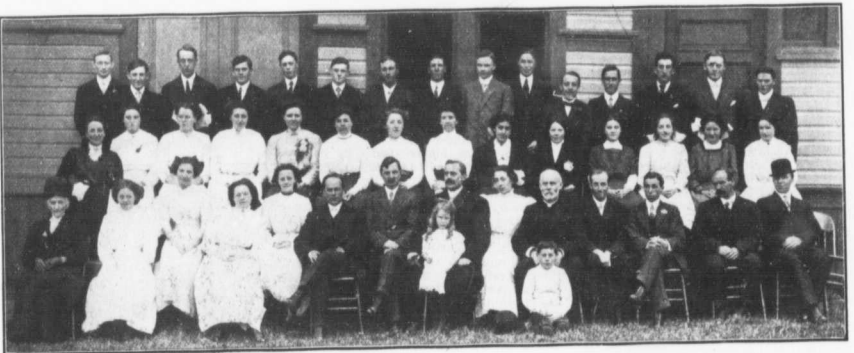
A GROUP OF SPLENDID EPWORTH LEAGUERS OF THE JAMES BAY CHURCH, VICTORIA, B.C.

The Epworth League of Berwick, Nova Scotla, has just closed its most successful year of its twenty-one years' existence. It raised during the year from various sources over $100.00; has four departments in good working order, viz. Christian Endeavor,