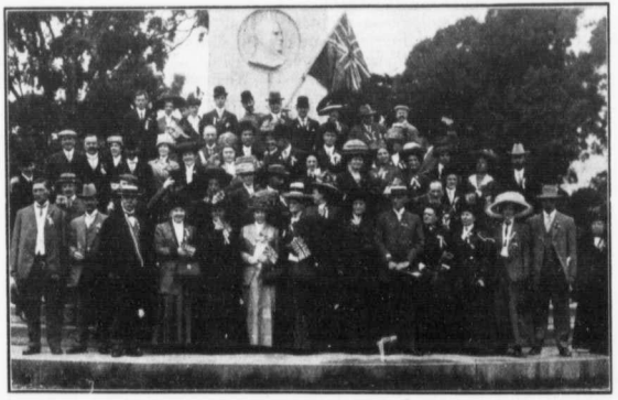
THE CANADIANS WHO CELEBRATED AT SAN FRANCISCO, CORONATION DAY.