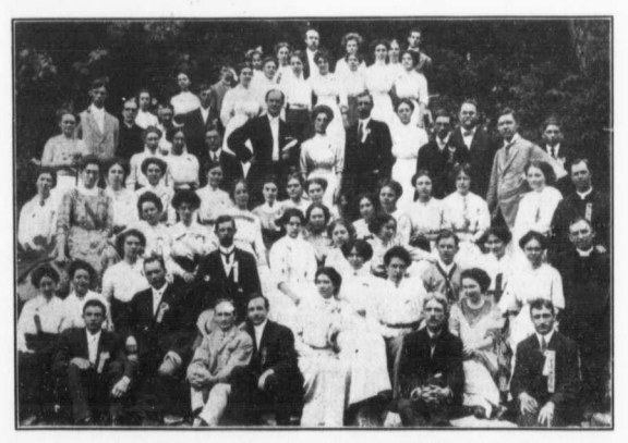
THE HAMILTON CONFERENCE SUMMER SCHOOL AT ELORA.