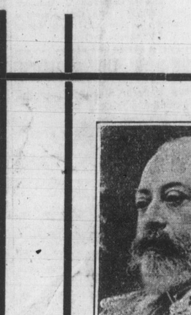
KING EDWARD VII

All religious bodies issued calls for special prayers and special services had been arranged for tomorrow for intercessions for the King. The Catholic Archbishop of Westminster, Abbot, Bourne, said the King's critical