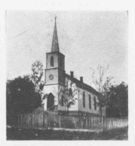
FIRST ENLARGEMENT OF THE CHURCH,