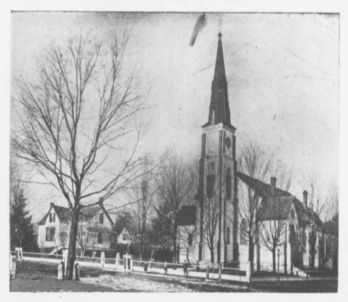
THE CHURCH PULLED DOWN IN 1888, TO MAKE ROOM FOR PRESENT EDIFICE.