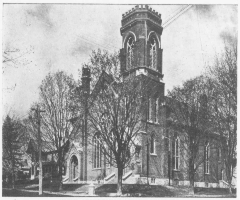
ORILLIA PRESBYTERIAN CHURCH AND MANSE.