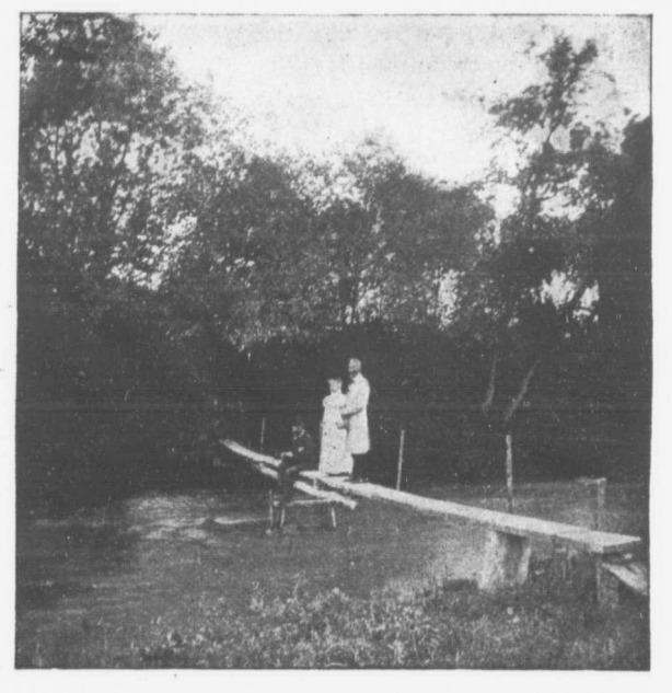
THE PLACE WHERE SHE CROSSED.