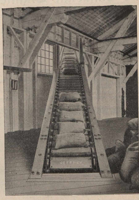
Carrier at Dock End.

As shown by the accompanying illustrations, the dock and warehouse are connected by a light elevated structure