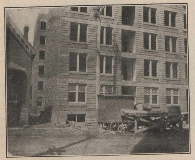
Apartment Block Under Construction at Ottawa.

That Canada is not behind the times in concrete construction is evidenced by the erection in Ottawa of a large apartment house in the centre of the city. The accompanying picture shows a portion as yet uncompleted. The construction is absolutely fireproof, as the plaster is applied directly to the concrete walls. The mixer is shown in the foreground attached to an electric motor which is housed on wheels. A little over half of the frontage of the building is visible in the picture. The floors are laid continuously from side to side of the building, being reinforced by heavy steel