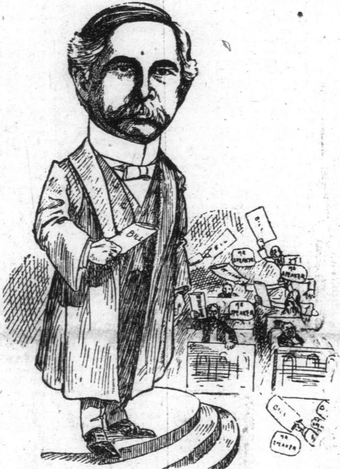
Registered in accordance with the Copyright Act by the Newspaper Artists and Cartoonists' Society of Canada.

The Hon. Robert Franklin Sutherland B. A. K. C. Speaker of the House of Commons.