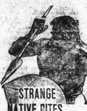
STRANGE NATIVE RITES