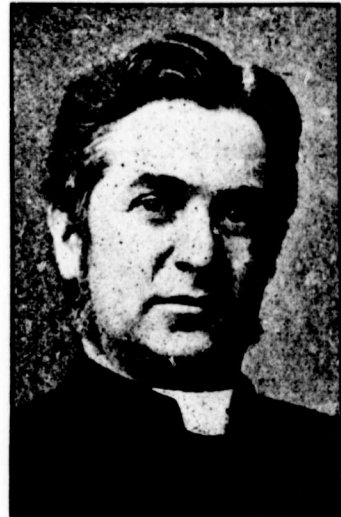
BISHOP SCOTT, OF NORTH CHINA.

It is interesting to note, in view of the present disturbed state of affairs in China, that the Diocese of North China, which was founded in 1880, consists of the six northern provinces of China, and is six or eight times the size of England. The population is estimated at between eighty and a hundred millions. The staff of the North China Mission, headed by Bishop Charles Perry Scott, consists of thirteen or fourteen clergy. Bishop Scott has been labouring in China for a little more than a quarter of a century.