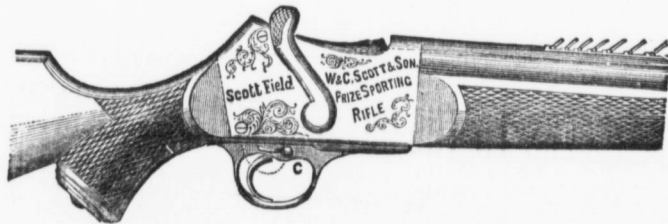
THE "SCOTT-FIELD" SPORTING RIFLE.

The above cut represents the new "Scott-Field" Rifle, manufactured by W. & C. Scott & Sons, Birmingham, England, for general sporting purposes. This Rifle has the "Field" patent action, which is considered by all sportsmen who have seen it to be the best ever invented. The fact that Messrs. W. & C. Scott & Son and John Rigby & Co., of Dublin, have adopted the "Field" action for their new Sporting and Target Rifles, is proof positive that, in the opinion of these celebrated gun-makers, the "Field" is superior to all other actions now in use. The "Scott-Field" Sporting Rifle is 44 cal., sighted up to 300 yards, and can be had either with plain or pistol-grip stock. No Rifle in the market can approach it for simplicity, accuracy, convenience, durability and safety.