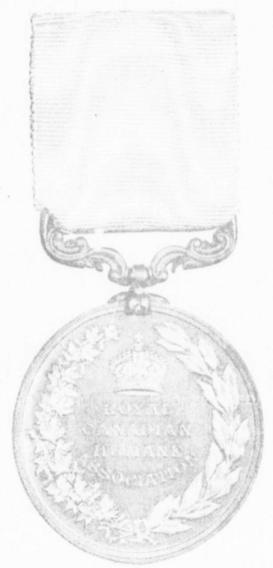
THE ASSOCIATION BRONZE MEDAL