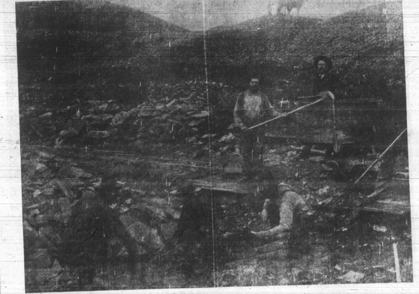
No. 2 ABOVE ON BONANZA