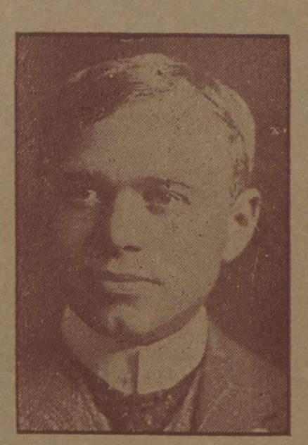
BARON BEAVERBROOK Honourary Colonel of the Kilties.

Obtain a COMPLETE SET OF BADGES before leaving