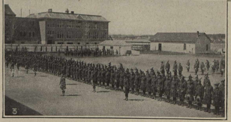
Presentation of Military Medal to Lce.-Cpl. Moore. (2) Battalion in line. General Officers inspecting. (3) Battalion in line. Battalion in mass. (5) Battalion in hollow square.