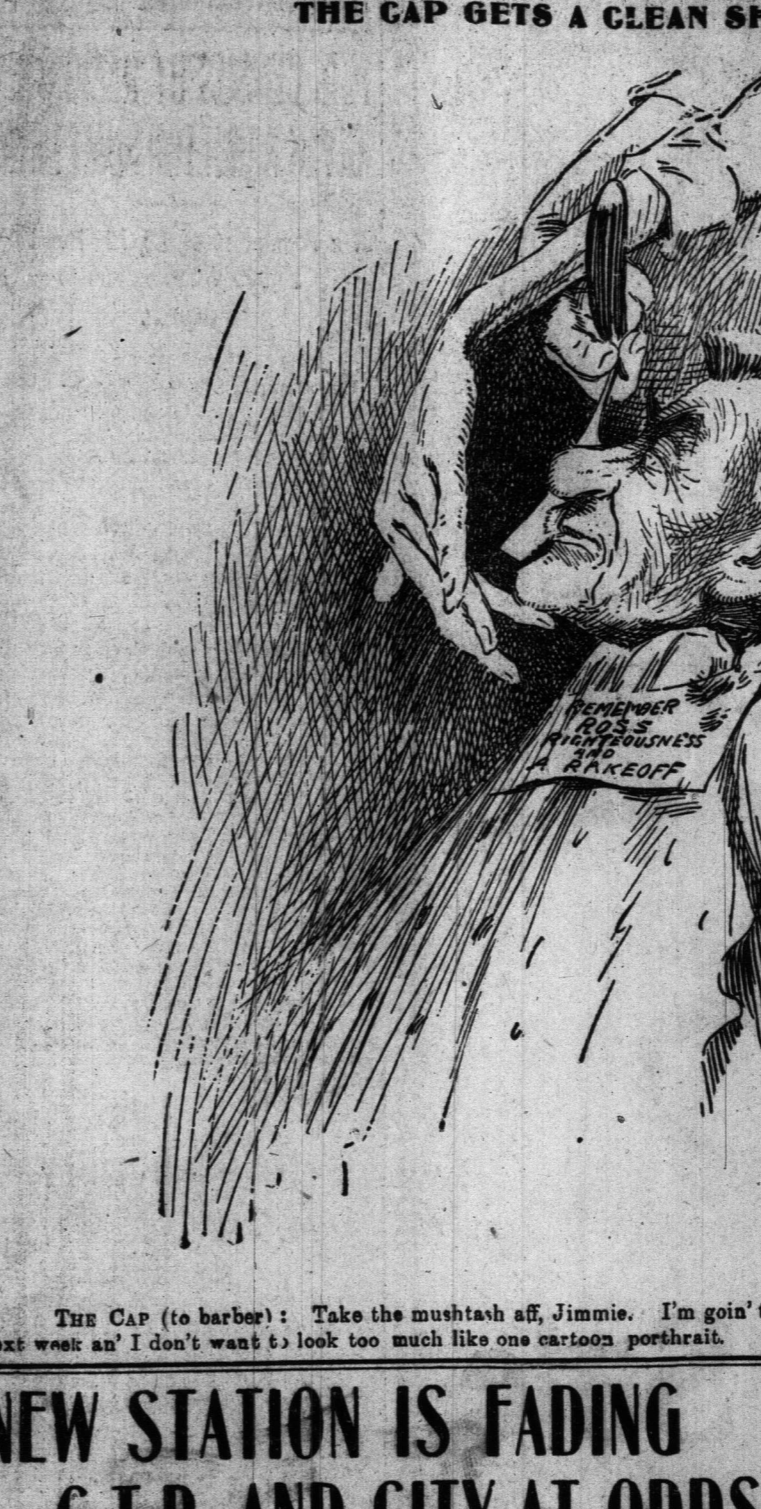
The Cap (to barber): Take the mustash off, Jimmie, I'm goin' to do a bit av campaign' wid th' boss next week an' I don't want to look too much like one cartoon portraith.