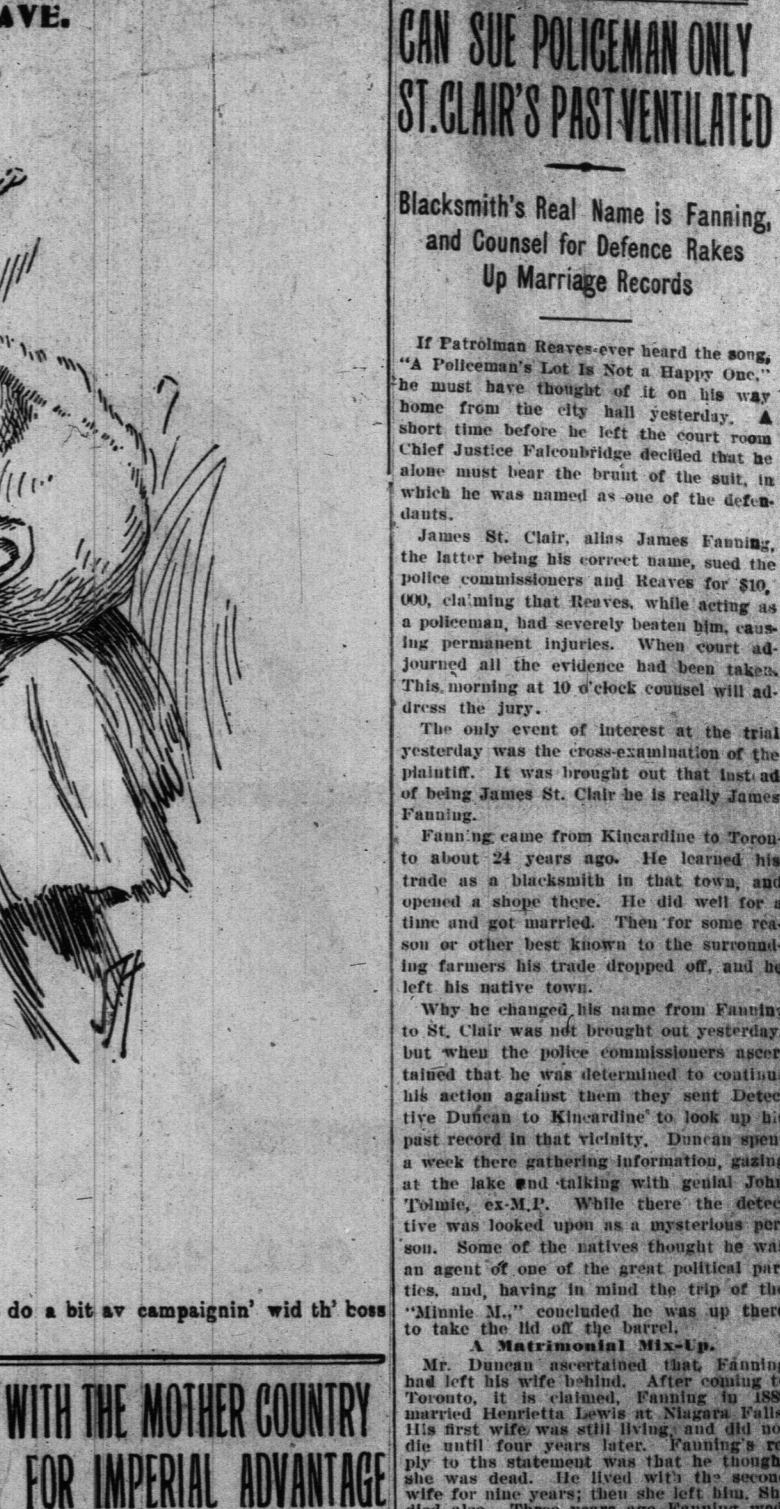
The Cap (to barber): Take the mustash off, Jimmie, I'm goin' to do a bit av campaign' wid th' boss next week an' I don't want to look too much like one cartoon portraith.