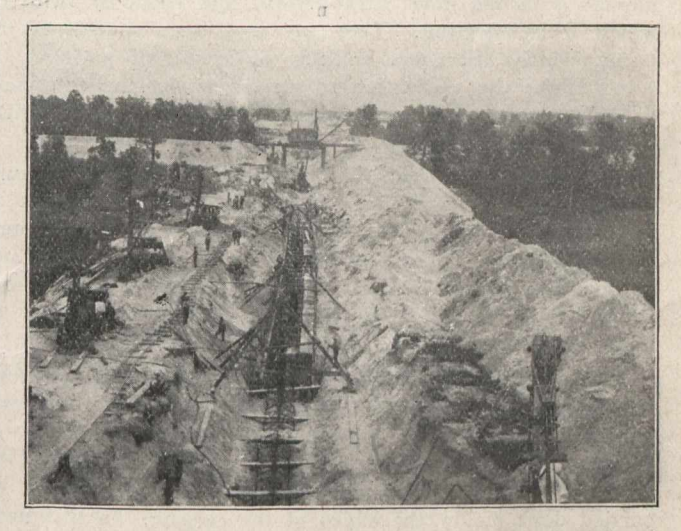
Bird's Eye View of Cary Sewer, Showing Pumping Plant, Trench, Clamshell, Backfilling and New Steel Plant in Far Distance.

This arrangement is accomplished by means of a fourway connection in the suction of each pump, about one foot below the pump. The two 4-inch rubber hose, branching