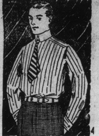
24c. to $2.30 each. Narrow and wide ends. Our name band on each is guaran-

'PHONE 484. MAIL ORDERS RECEIVE CAREFUL CONSIDERATION.