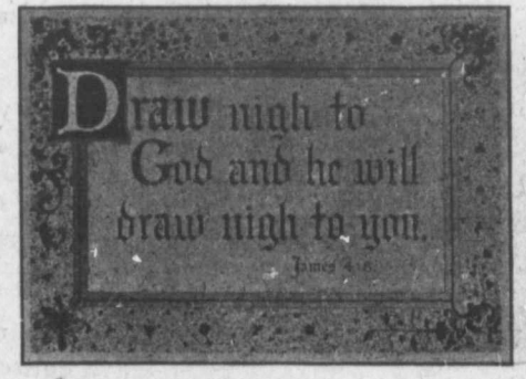
No. 332C-35 cents each. Size 101/4 x 14

Send for illustrated descriptive folder, FREE