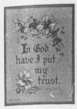
No. 304—10 for 30 cents. Size 41/4 x 51/2