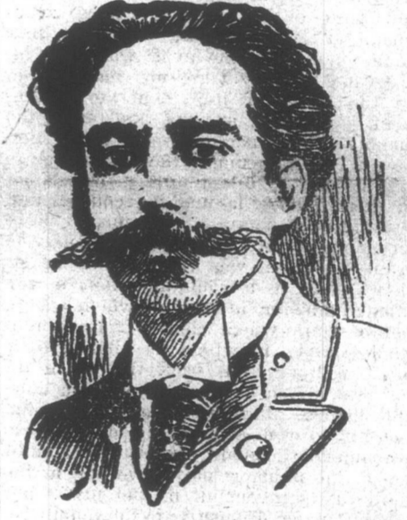
Gonzalo de Quesada, Secretary of the Cuban Revolutionary Party.