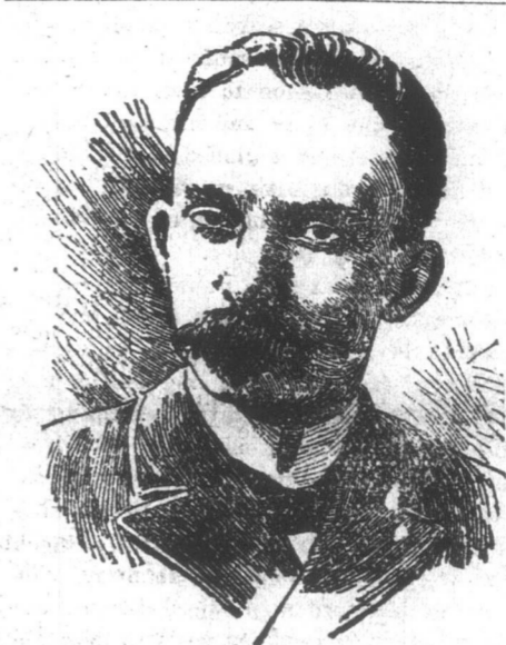
José Martí, Civil Leader and President of the Cuban Revolutionary Party.