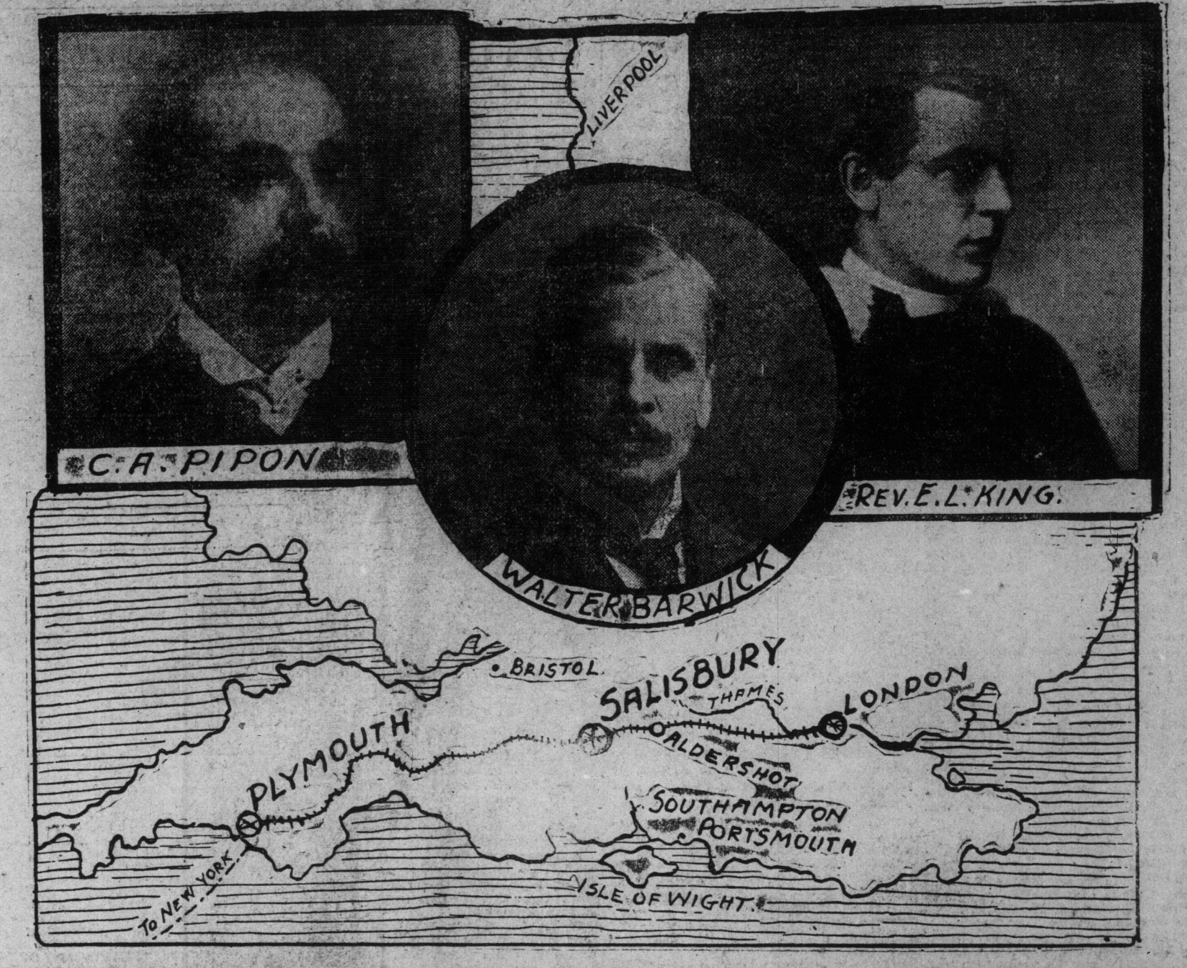
Map Showing the Location of Salisbury, Where Sunday's Terrible Catastrophe Occurred.

The first coach shot over the engine, the first shock having wrecked