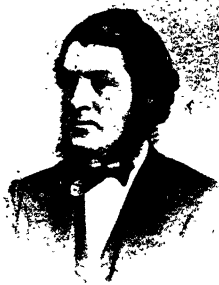
THE HONORABLE SIR CHARLES TUPPER, BART., G.C.M.G., C.B., M.P.

From a photograph by Notman, Montreal, taken in 1864.