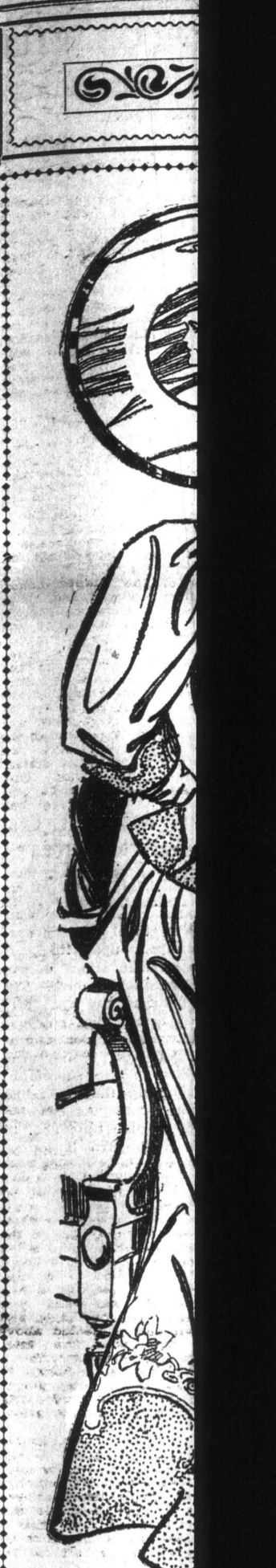
As I See Spring