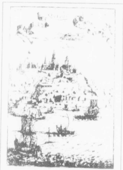
Bibliotheque Dationale du Quebec