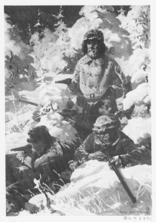
The defenders were reduced to four