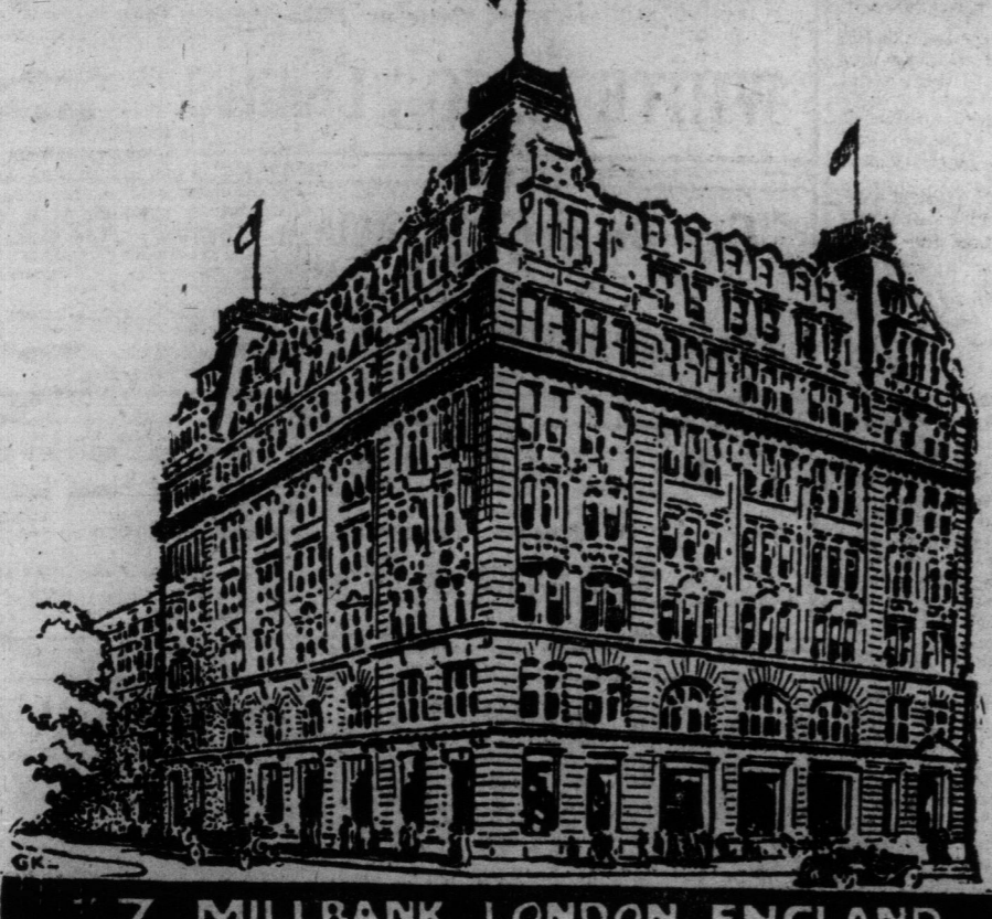
7 MILLBANK, LONDON, ENGLAND