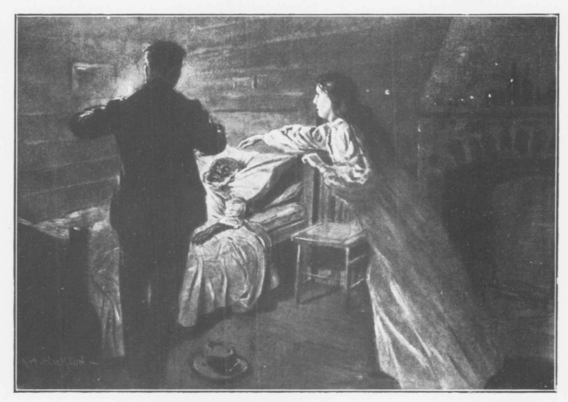
"Gertrude sprang through the doorway, rushed to the bedside, and fiercely struck up the hand in which Horace held the deadly weapon."