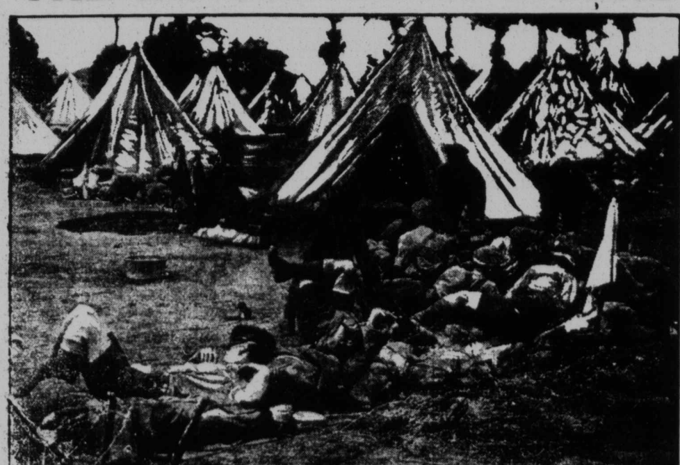
Just out of the trenches.—Some sleep whilst others play cards.