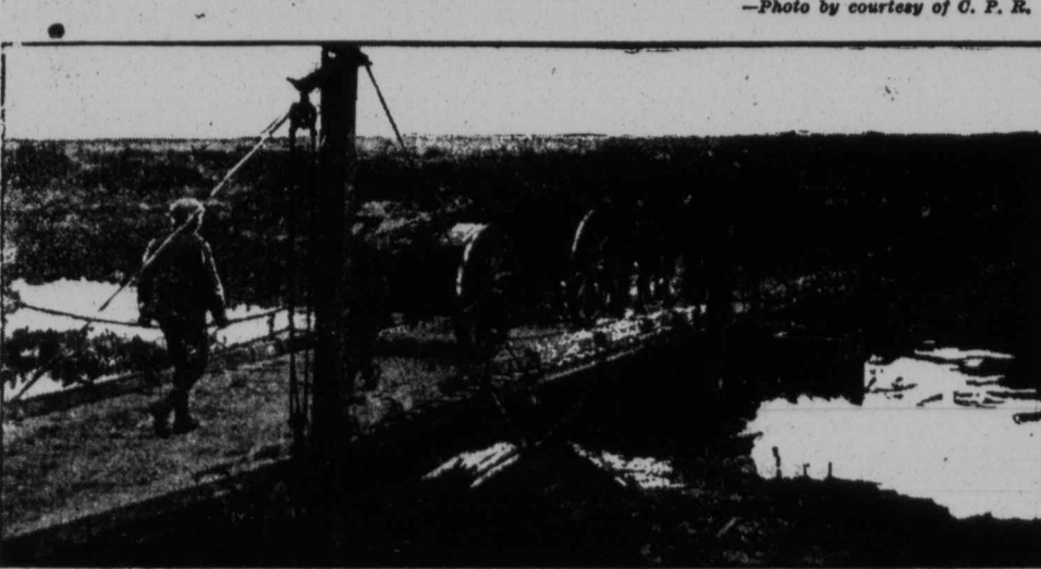
Artillery crossing the Yser.