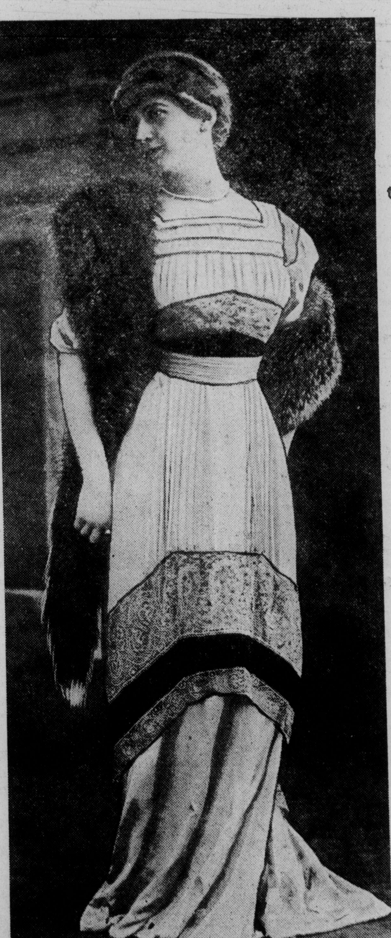
Pink Chiffon Gown With White Lace and Black Velvet

A person sitting on the saddle rests his feet on this trans- that the beavers never plaster their verse axle, and by suitable pressure can alter, at once, the house with mud. From the water of relation of the wheels to the main axis of the framework. the beavers pond at the Bronx rose a This arrangement furthermore leaves his hands completely house which, in spite of the book, the free for adjusting the position of the sail or using a brake. The whole device has a certain lightness and elegance which will appeal probably at first to the lover of sport. Con- world where, in regard to such a habit tests of speed will involve but little of the danger accom- of wild life, the field observer could be panying competition with cycles or automobiles, but will af- so corrected? ford play rather for the quickness and deftness required of Nowhere in the world are animals so