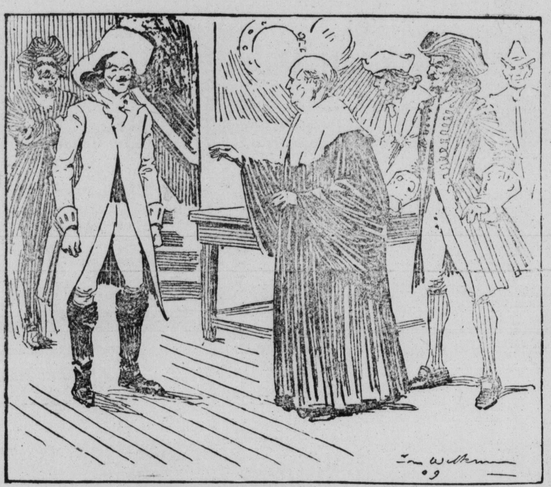
"I Would Have No Man's Blood on My Hands!"