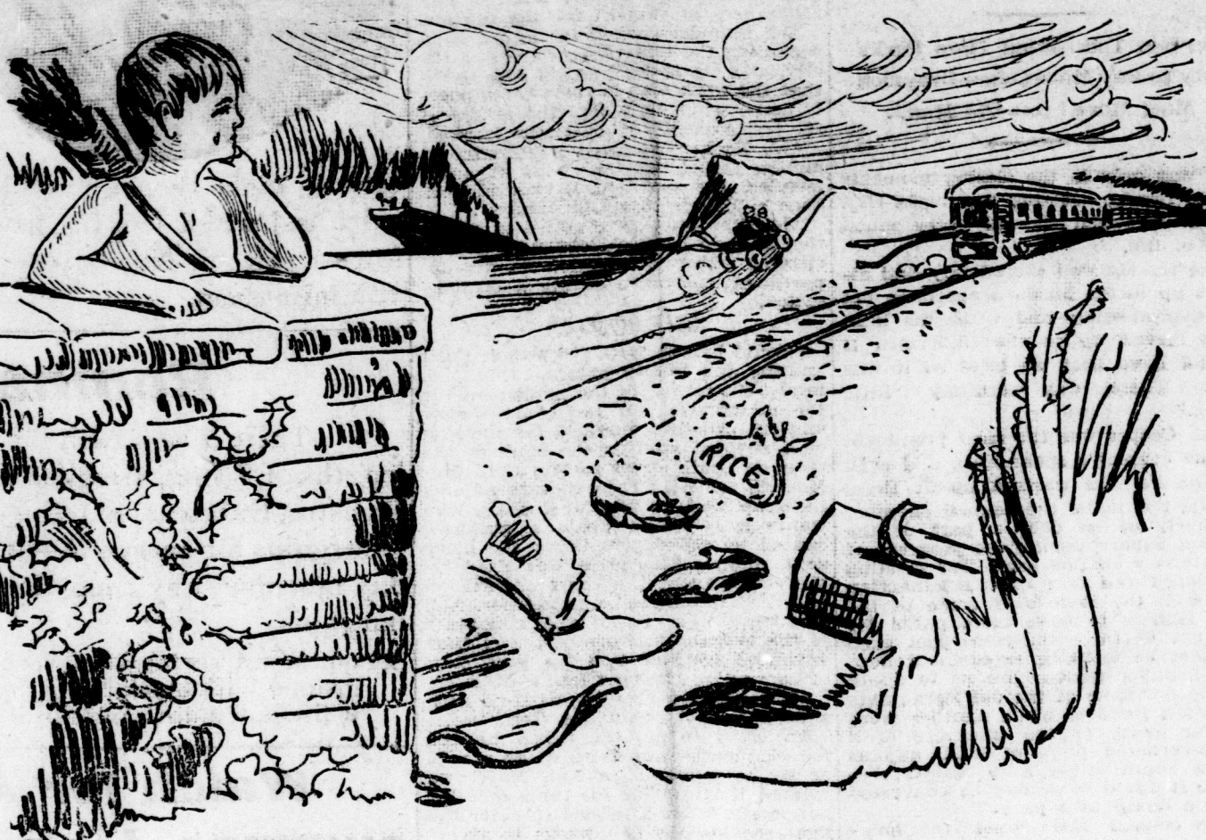
Cupid---Thank goodness, June is over at last!

Before leaving the room they all kissed the hand of the Pontiff reverently. The Pope this morning expressed the desire of again taking communion, notwithstanding the fact that he received the last communion on Sunday and extreme unction last night.