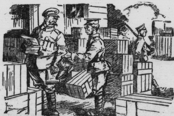
Slightly on the Large Side.

The Recruit: "Sergeant, would you mind changin' this pair o' boots for me? They're too big. (Apologetically) I think what you was lookin' at on the paper was my age, not the size of my feet."—London Opinion.