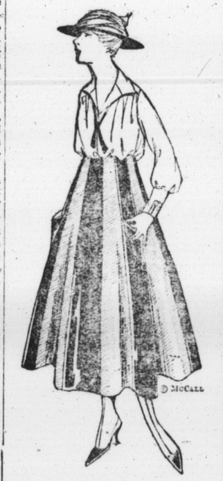
New Gored Skirt with Simple Waist

As Separate Blouses. The waists to go with separate skirts and suits are, as a rule, very simple. White and pale flesh-colored blouses are still favored, though the fashion of having the blouse match in color the suit with which it is to be worn is again coming in. For this reason there are some dark blouses seen. Satin and Georgette are combined for waists that form part of the