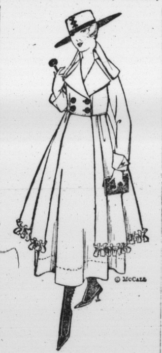
Reflecting the Directorate Style

Tunics are quite fashionable this season and there is a large variety of different styles. A novelty seen very