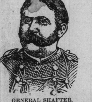
GENERAL SHAFER. Commanding U. S. Forces Before Santiago.