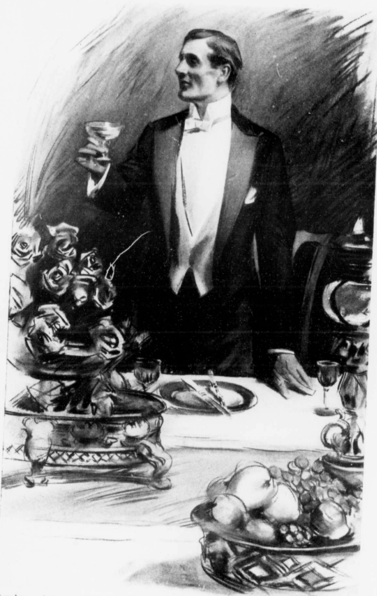
Speeches and Toasts ]