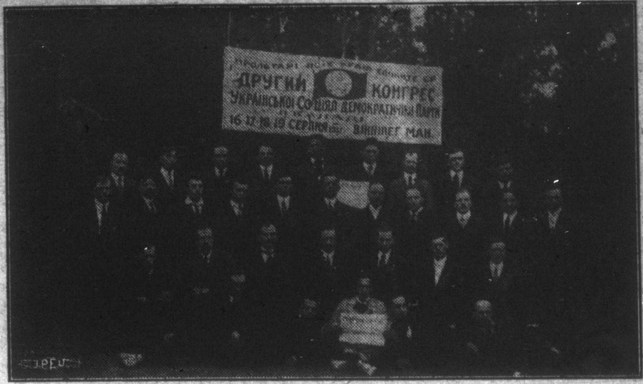
THE UKRANEAN CONVENTION AT WINNIPEG

"My country is the world, and my religion is to do good."—Thomas Paine.