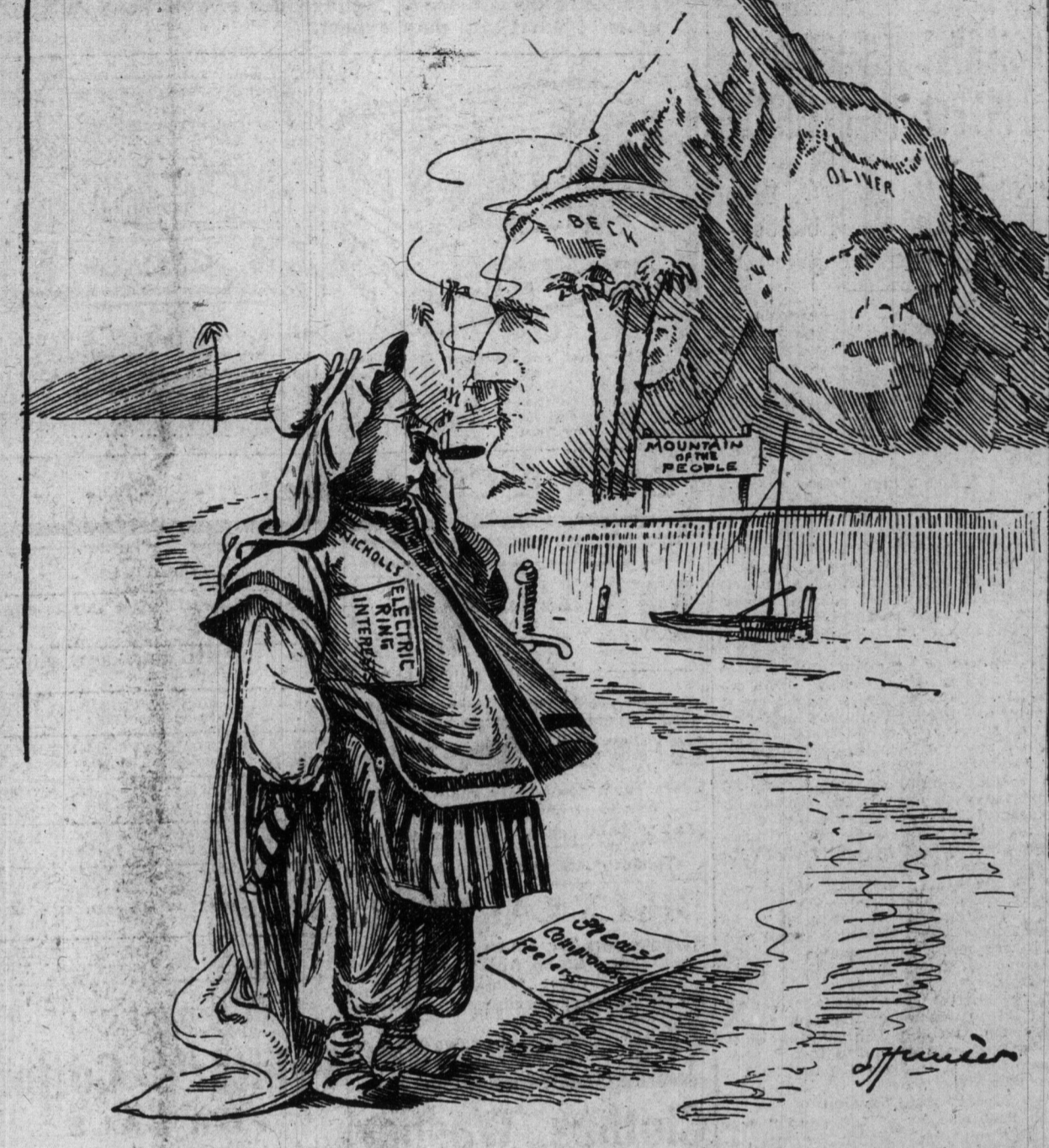
MAHOMET NICHOLLS: Well, if the Mountain will not come to Mahomet, I guess it's up to Mahomet to go to the Mountain.