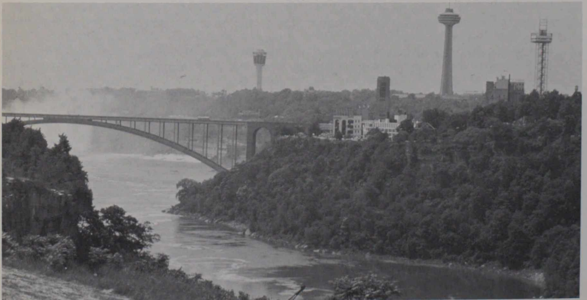
The Peace Bridge.

There are also two railroad bridges: the Canadian National Railway's International Bridge at Buffalo, a mile and a half north of Peace Bridge, and the New York Central Bridge near Whirlpool Rapids Bridge.