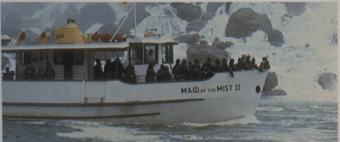
One of the Maids-of-the-Mist .

One may ride past the American Falls and into the heart of the pool below the Horseshoe Falls on the Maid-of-the-Mist (any one of the four sturdy boats bearing that name) while wearing a hooded raincoat. There will be spray in one's face and a great roar in one's ears.