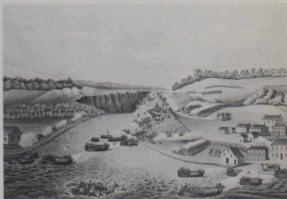
The Battle of Queenston, October 13, 1812.

Treaty of Ghent, signed on December 24, 1814, restored the Peninsula to peace and its former boundaries.