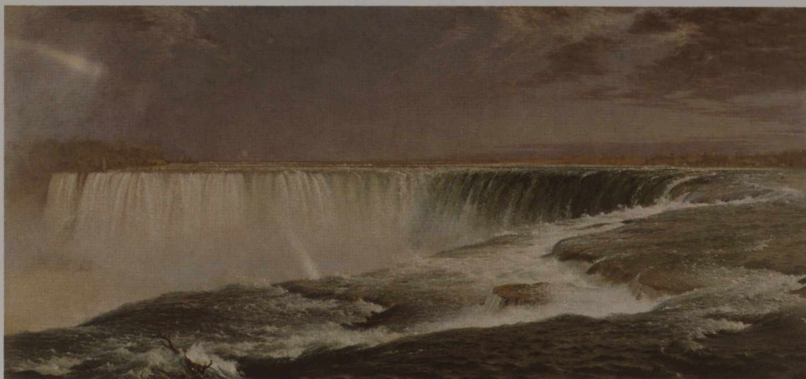
Frederic Edwin Church: Niagara Falls IN THE COLLECTION OF THE CORCORAN GALLERY OF ART.

The escarpment wiggles southeastward down the map like a black snake from Georgian Bay to Niagara Falls, separating the four larger Great Lakes from the one at the bottom. Along the way creeks and riverlets pour over the edge.