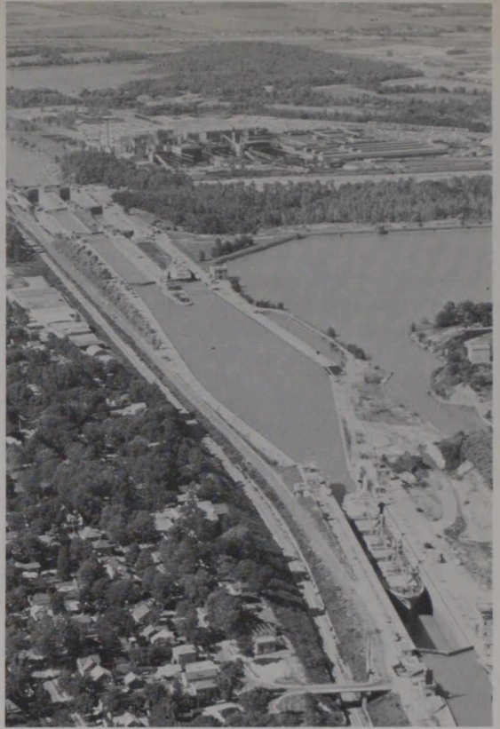
The Welland Canal.

Rainbow Bridge, opened in November, 1941, reaches gracefully from Niagara Falls, N.Y., to Niagara Falls, Ont. Its predecessor, called the Honeymoon Bridge, collapsed under the stress of an ice jam in 1938 after forty years of use.