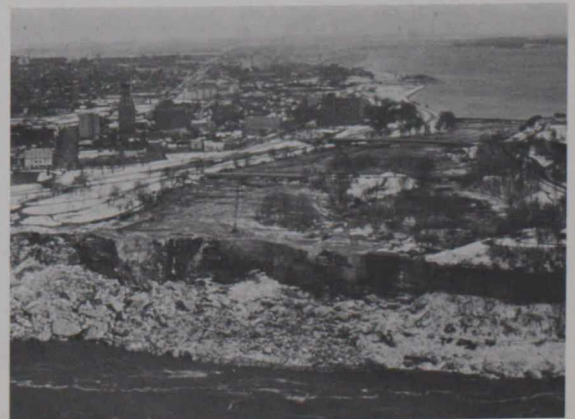
The American Falls dewatered.

Pack ice had been driven up Lake Erie by a strong easterly wind. On March 29 the wind reversed and jammed the ice field into the mouth of the Niagara, between Fort Erie and Buffalo, damming the flow. Thirty hours later the wind shifted and the river mouth was uncorked.