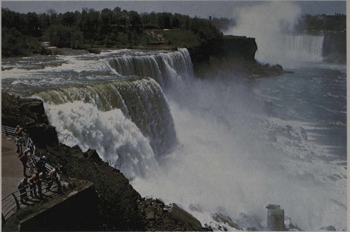
The American Falls.