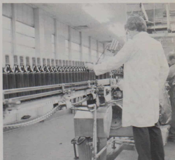
After the grapes are harvested, they are tested for quality and sweetness and dumped into hoppers to enter the winery. Then they go to fermentation tanks where the sugar in the grapes turns to alcohol. After the aging process the wine is bottled and inspected.