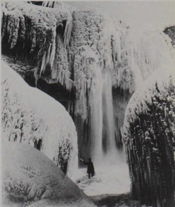
Niagara in winter.

Firemen, policemen and railroad workers lowered ropes from the Cantilever and Whirlpool Rapids Bridges as thousands watched. The stranded trio caught the ropes but were unable to hold on to them, and they were carried into the icy waters of the Whirlpool and drowned.