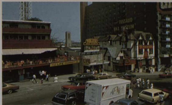
Clifton Hill, Niagara Falls, Ontario.

One may choose among Tussaud's Wax Museum, the Frankenstein Museum, the Niagara Falls Museum, the Houdini Museum, Ripley's Believe It or Not Museum, the Life Museum and the Movieland Museum.