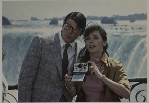
Clark Kent and Lois Lane in Superman II .

In New York the Niagara Frontier States Park Commission maintains Goat Island and Prospect Park on the mainland, which extends along the rapids in the upper river, and parks at Devil's Hole and on Grand Island.