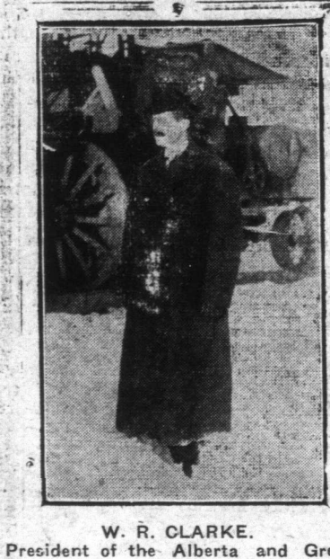
Waterways Railway Co., Named as Defendant in $250,000 Suit.