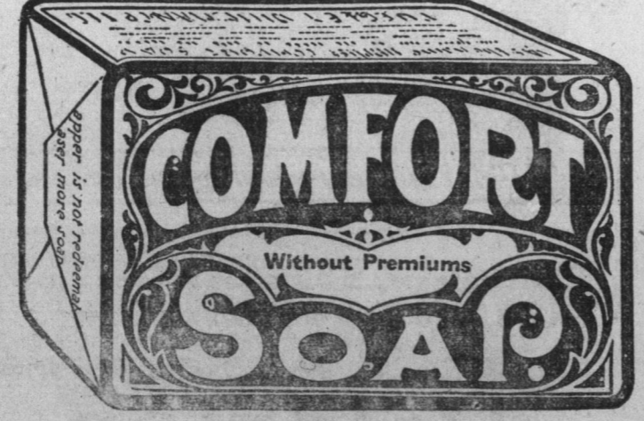
ACTUAL SIZE—the "Bigger Bar"

For 25 years "Comfort" has been Canada's favorite—for 25 years the biggest seller. Remember, Comfort washes perfectly in hot or cold water, hard or soft. It reduces work. It cuts expenses. The big chunky bar fits the hand.