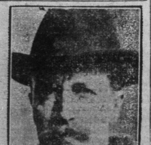
LORD DUNMORE, V.C., who is at present a visitor in Canada. He won the V.C. in 1897 in Afghanistan, and the D.S.O. in 1916. He served in the front from 1911 to 1916, when he was wounded.