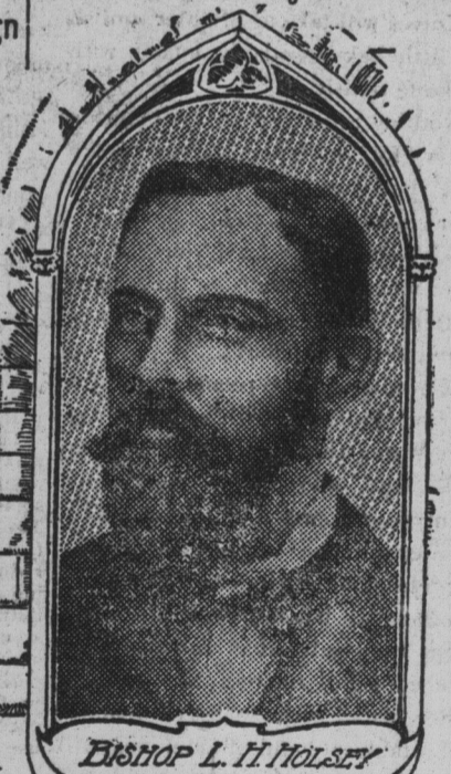
The Bishop's Strong Tribute to Pe-ru-na.

After Twenty Years Bondage to Catarrh He Is Relieved By Pe-ru-na.