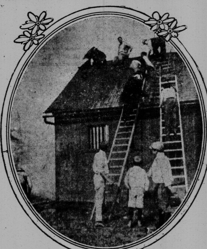
Mayor Gaynor fighting fire. He is seen in the foreground, holding a bucket and spraying water.