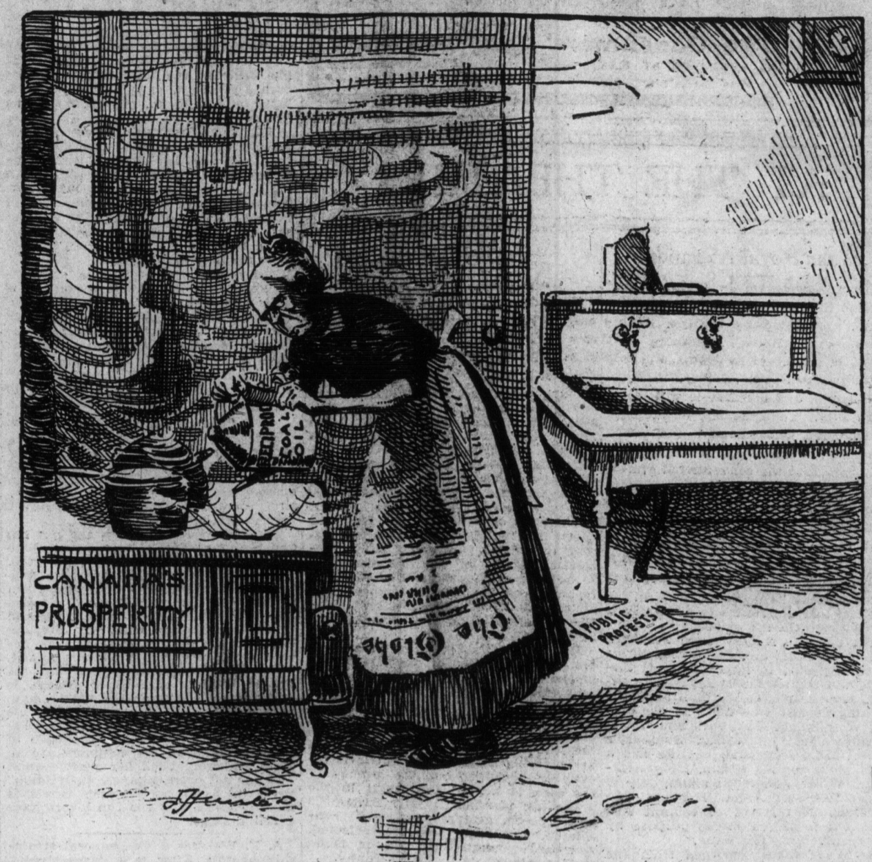
POLITICAL MARY ANN: "Iv th' fire's goin' good," th' missus says, "I luv it alone!" but I says, iv th' fire's goin' good make it go better