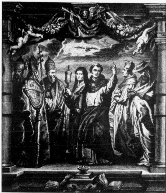
Saints exalting the Blessed Eucharist

atten- Our with us nd my h the e were e first ied in stood a was ssion, he fif- anner of the morn- con- they gen- New- is my rtise- Bar- ow in Com- Bar- As we h my your ns.— ence. head, Com- z.)