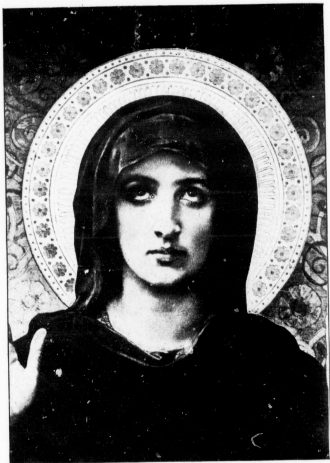
The Virgin of Consolation After a picture by Bouguereau