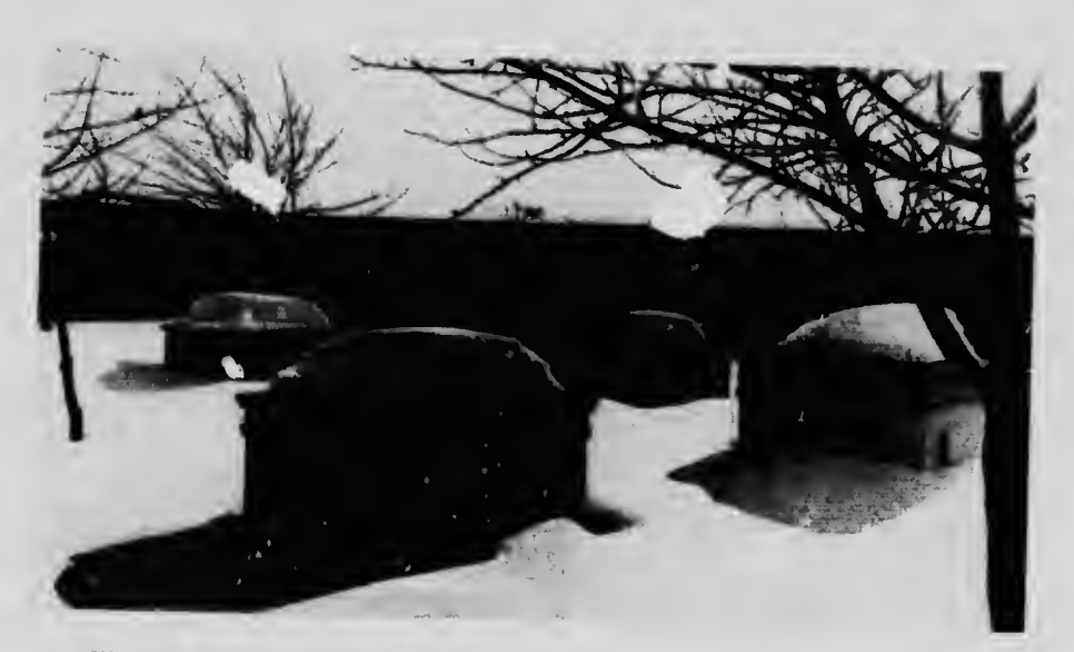
Wintering Bees at the Central Experimental Farm, Ottawa, in 4-Colony Cases.