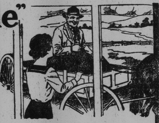
"You'll like the flavor"