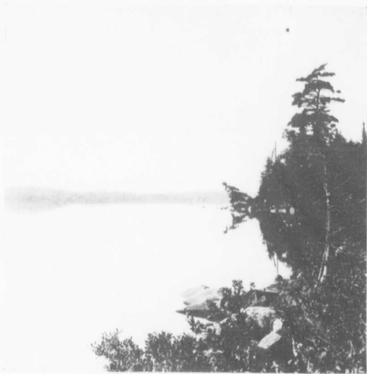
Non-i-wakaming Sakaigan. (Diamond Lake)