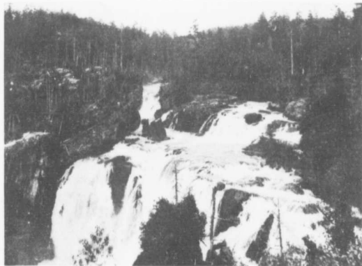
Aubrey Falls, Mississauga.

The second guide in the meantime has procured some wood, made a fire, unpacked the cooking utensils and provisions and prepared your meal. After the meal is finished, one guide washes up the things and gets the wood for the camp fire, keeps camp, while his partner is paddling the canoe for you to fish or hunt.