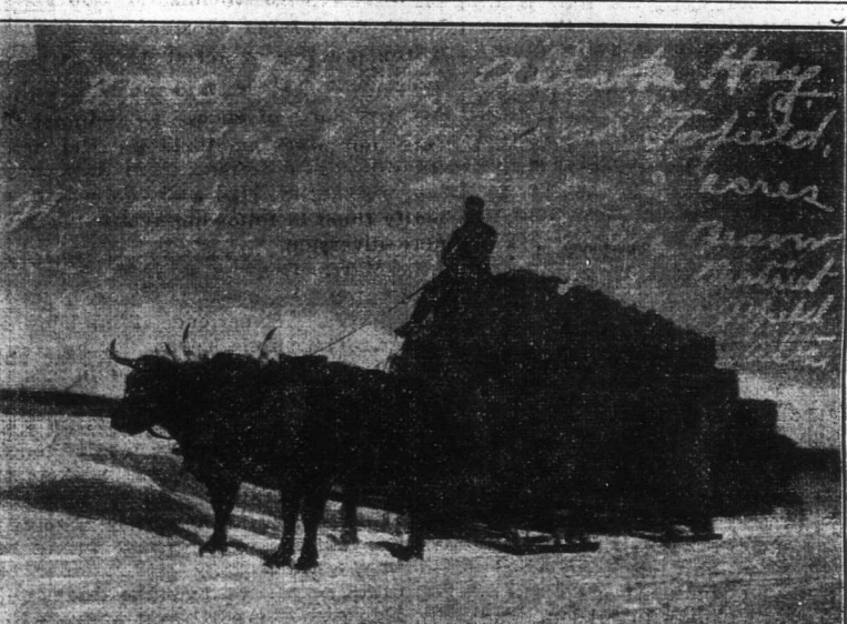
FOUR TONS OF ALBERTA HAY.

gether in the year 18:2 from Engand We made it a point to see the country north-east, east and south-east of Edmonton, also around Wetaskiwin east along Battle River and south of and have been engaged in farming in ling in Alberta in those days. Things seed from it. Others have raised corn beaver Lake district ever since. I looked very dulf and discouraging, for shorter periods. country-a lake 18 miles long and 10 miles wide, teaming with good fish district is better than any of them neer life. Their chief occupation squash, tomatoes, cucumbers, citrons, and thousands of wild geese, ducks and other fowl. When we examined the soil and found it rich, it was an easy matter to make up our minds what to do even though it were 75 miles from Edmonton by wagon road. We have farmed and ranched here