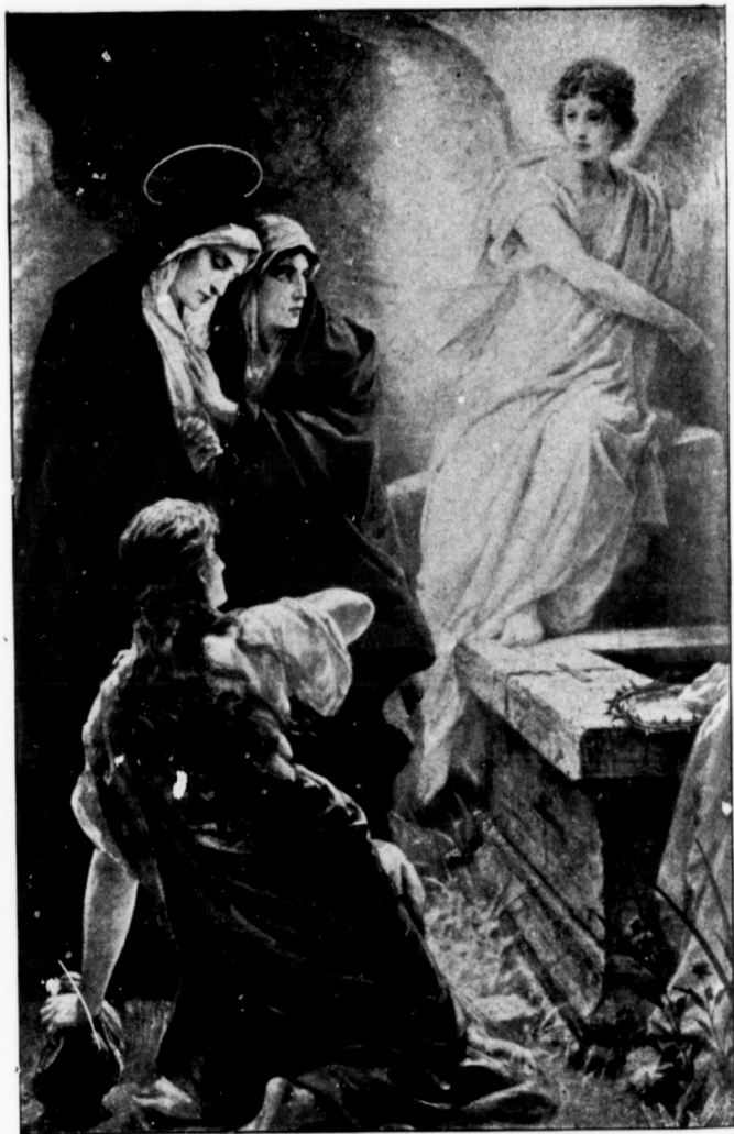
THE HOLY WOMEN AT THE SEPULCHRE after a painting by Plockhorst.