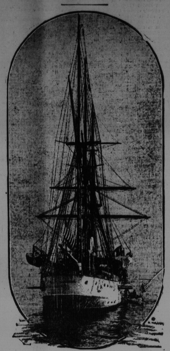
THE U. S. GUNBOAT WHEELING ORDERED TO HONDURAS.