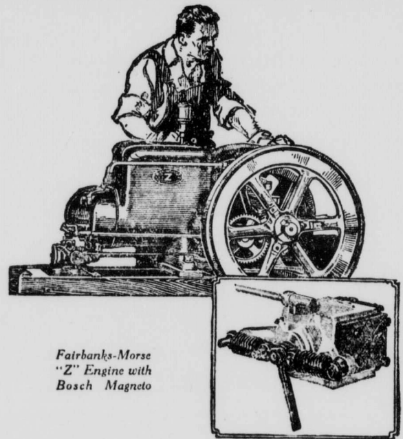
Fairbanks-Morse "Z" Engine with Bosch Magneto